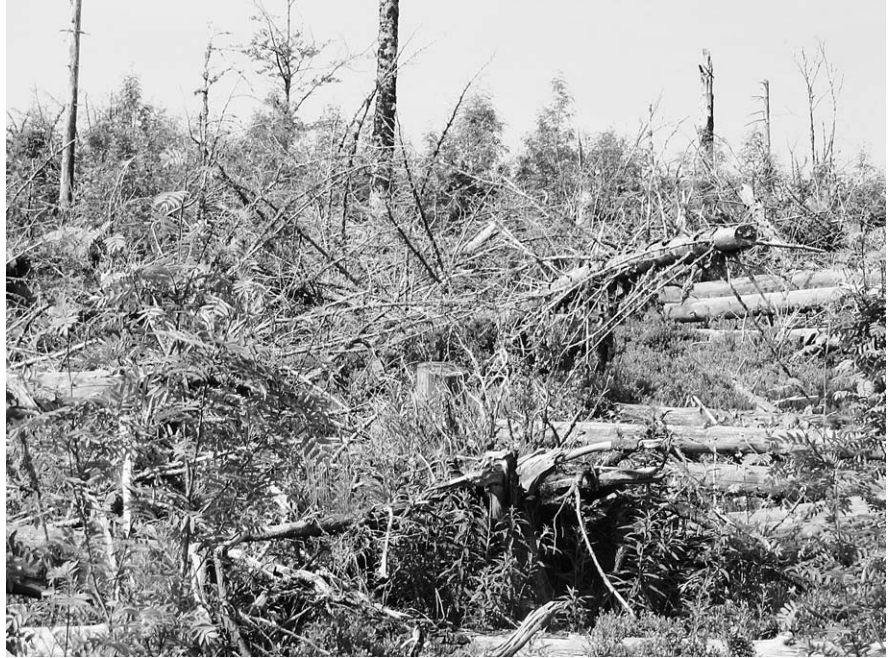
FIGURE 1 Dynamics of natural reforestation along the “Lothar” trail in the Black Forest, Germany: within a few years of the devastating 1999 storm, young trees could be seen thriving between the dead wood left lying on the ground.

Because a storm-devastated forest area can only be observed safely from a distance, an adventure trail had to be constructed to make the area accessible to the general public. This trail now provides thrilling insight in the form of a fixed rope route, leading over and under fallen trees. By contrast with the still very