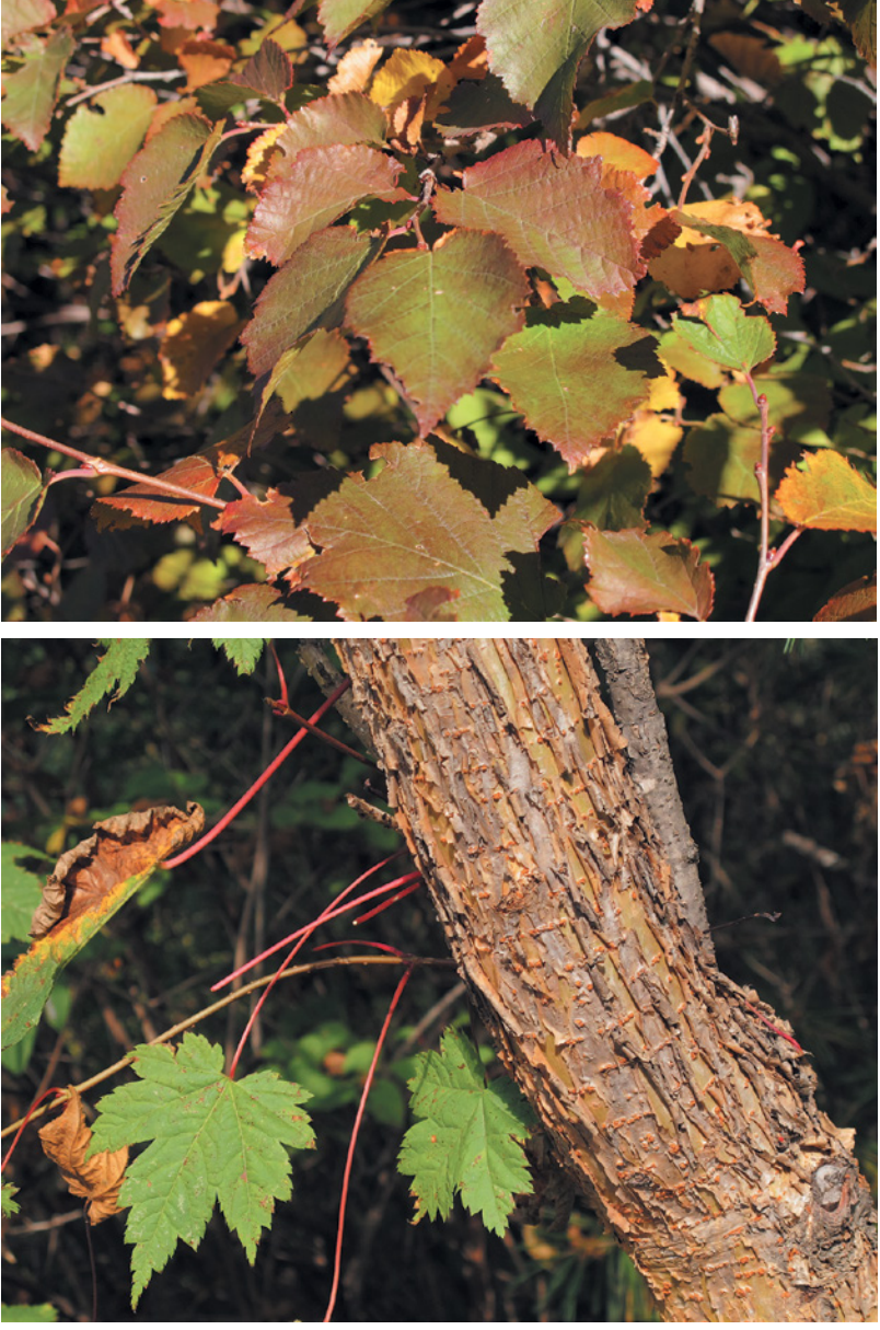
Ostryopsis davidiana (top) and Acer caudatum ssp. multiserratum (bottom) are among the species on the list of desiderata. The specimens seen here were photographed in China during the 2010 NACPEC expedition.

Living Collections are to be considered fully synoptic and representative of Earth's temperate woody flora, over 175 species and 40 genera not represented will be targeted and acquired. Acquisition of the rare is essential, and the list of desiderata includes over 50