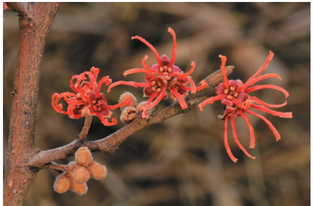
Conservation of rare and endangered species is a priority at the Arboretum. One example is bigleaf witch-hazel ( Hamamelis ovalis ), a North American species that was first identified in Mississippi in 2004.

include key additions of taxa with strongly divergent phenologies, structure (habit, morphology, anatomy), or physiological traits associated with adaptation to environments that differ from other members of a clade, such as evergreen taxa in clades historically represented only by deciduous taxa (or vice versa). Attention to biological (and phylogenetic) breadth will significantly improve scholarship opportunities associated with comparative research endeavors within a single botanical collection and expand the public's understanding of botanical and horticultural diversity within key genera and families of plants.