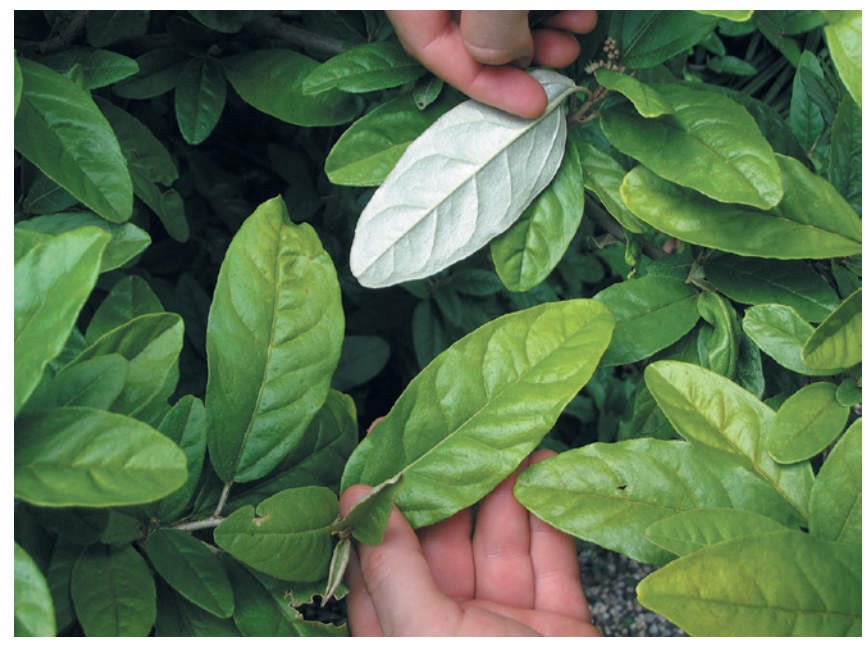
Croton alabamensis , a rare semi-evergreen shrub, is one of the species the Arboretum plans to acquire.

Beyond the focused development of the 17 genera above, many other species must be added to achieve the stated goals. If the Arboretum's