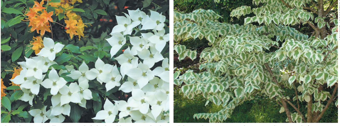
The Arboretum's collections include both wild species and cultigens (plants whose origin or selection results primarily from intentional human activity). This specimen (left) of kousa dogwood ( Cornus kousa 1079-89-C) was grown from seed wild collected in China during the Arboretum's 1989 Eastern China Expedition; at right, a variegated cultivar ( C. kousa 'Snowboy' 507-82-A) that was originally selected at the Sakata Nursery Company in Yokohama, Japan.

reflect the importance of phylogenetic knowledge, organismic biology, conservation biology, genomics, and horticultural leadership to the future of the Arnold Arboretum.