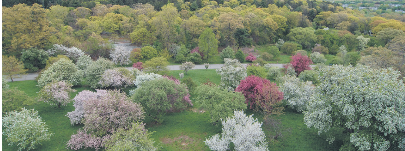
The Arboretum's collection of Malus (apples and crabapples) currently holds 426 individual plants from 310 accessions comprising 159 taxa, many of which grow on Peters Hill, seen here.

It has remained a traditional arboretum , with the Living Collections continually and almost exclusively focused on temperate woody plants. It has been committed to collections-based woody plant scholarship , particularly in recent years with the significant expansion of on-site research associated with construction of the Weld Hill Research Building. The Arboretum landscape remains true to the vision of Freder ick Law Olmsted's design , through keen awareness of its role as a public garden and landscape. Lastly, the Arnold Arboretum has long invested in active curation and collections management , which in turn has fostered and enabled its research and preservation enterprises.