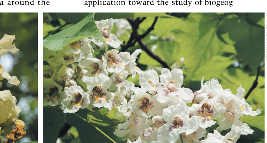
Catalpa is a disjunct genus with similar looking species growing in eastern Asia and eastern North America. Seen here are Chinese catalpa ( C. ovata 237-2002-B, left) and northern catalpa ( C. speciosa 1245-79-C, right), a North American species.

Within the Living Collections of the Arnold Arboretum, the floras of eastern North America and eastern Asia have long been extremely well represented. Yet, to maximize the Living Collections' further application toward the study of biogeog-