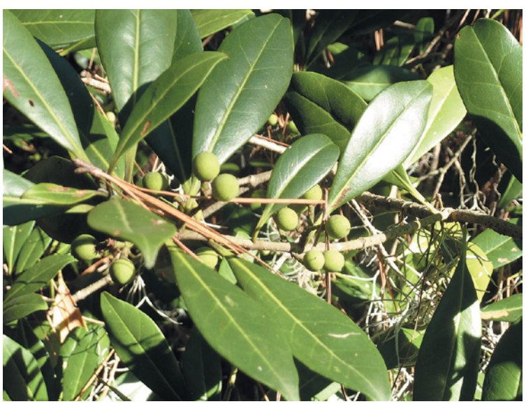
The Arboretum will acquire and trial marginally hardy species such as Daphniphyllum macropodum (left; seen growing at the Morris Arboretum in Philadelphia) from eastern Asia and Osmanthus americanus (right), which is native to the southern United States.

ciples above (Table 1). With this target list, the immediate goal is to obtain one new lineage of each taxon. However, in the longer term most targeted taxa will require multiple acquisitions from varying parts of their ranges to ensure broad genetic representation. All taxa on the list are to come from documented wild populations. This will result in as many as 700 unique acquisitions and eventually some 2,500 accessioned plants (assuming all new marginally hardy taxa survive on the grounds). The individuals on the list represent taxa that the Arboretum has never attempted to grow, those attempted in the past yet worthy of further efforts (especially in light of climate change and a far more sophisticated understanding of the microclimates of the Arboretum grounds), as well as those represented yet insufficiently. It should also be noted that this list of desiderata reflects, almost exclusively, botanical taxa. In time, attention should be placed on prudent review and development within cultivar collections. Importantly, the listed taxa represent specific priorities, not a limited scope for all future acquisitions.