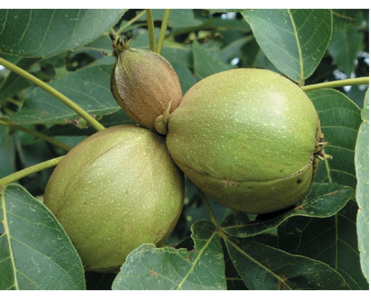
The Carya collection is one of six Plant Collections Network collections currently at the Arboretum. Seen here, fruits of shagbark hickory (C. ovata 22868-N) and bud scales and new shoots of shellbark hickory (C. laciniosa 806-87-C).

nial in 2072, the Arboretum community will be able to look back and pinpoint this campaign as one that guaranteed and secured a future where the Arnold Arboretum became the single most important living collection for those who study and enjoy temperate woody plants.